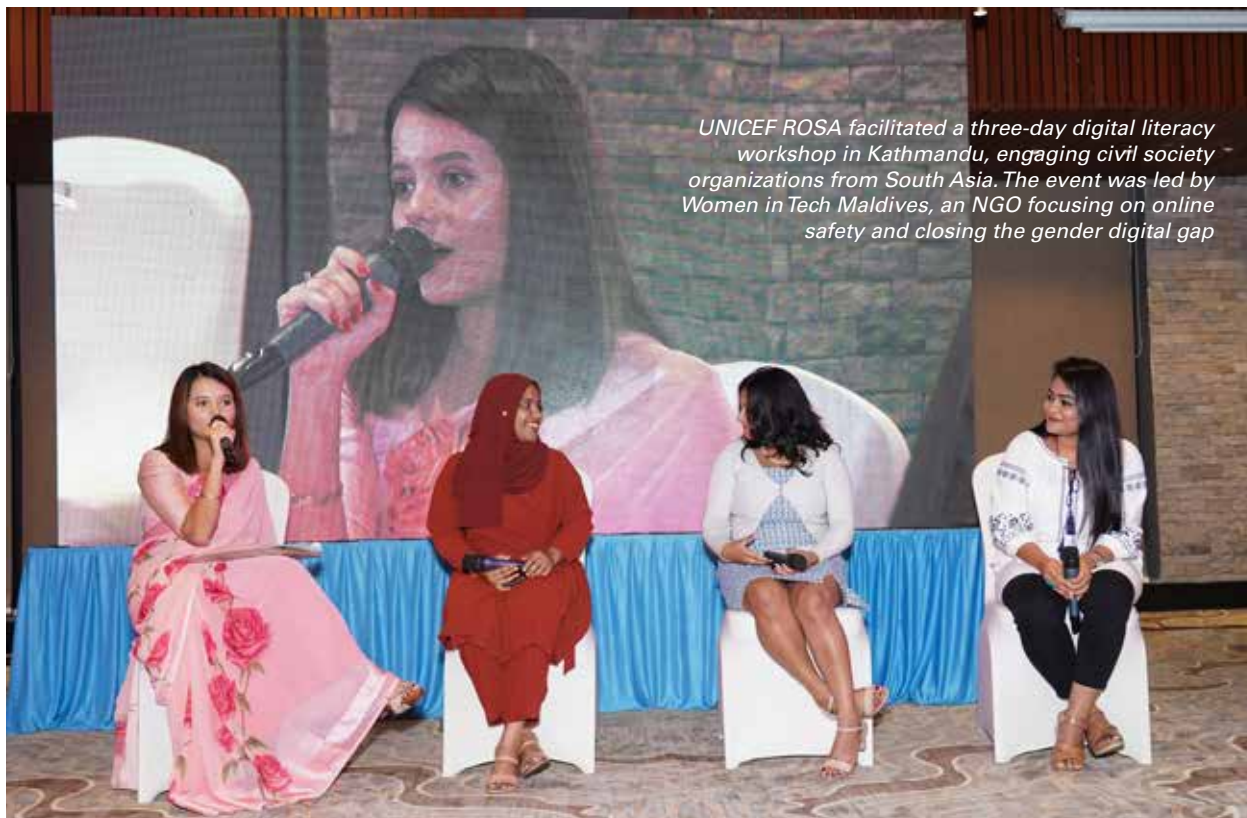
UNICEF ROSA facilitated a three-day digital literacy workshop in Kathmandu, engaging civil society organizations from South Asia. The event was led by Women in Tech Maldives, an NGO focusing on online safety and closing the gender digital gap