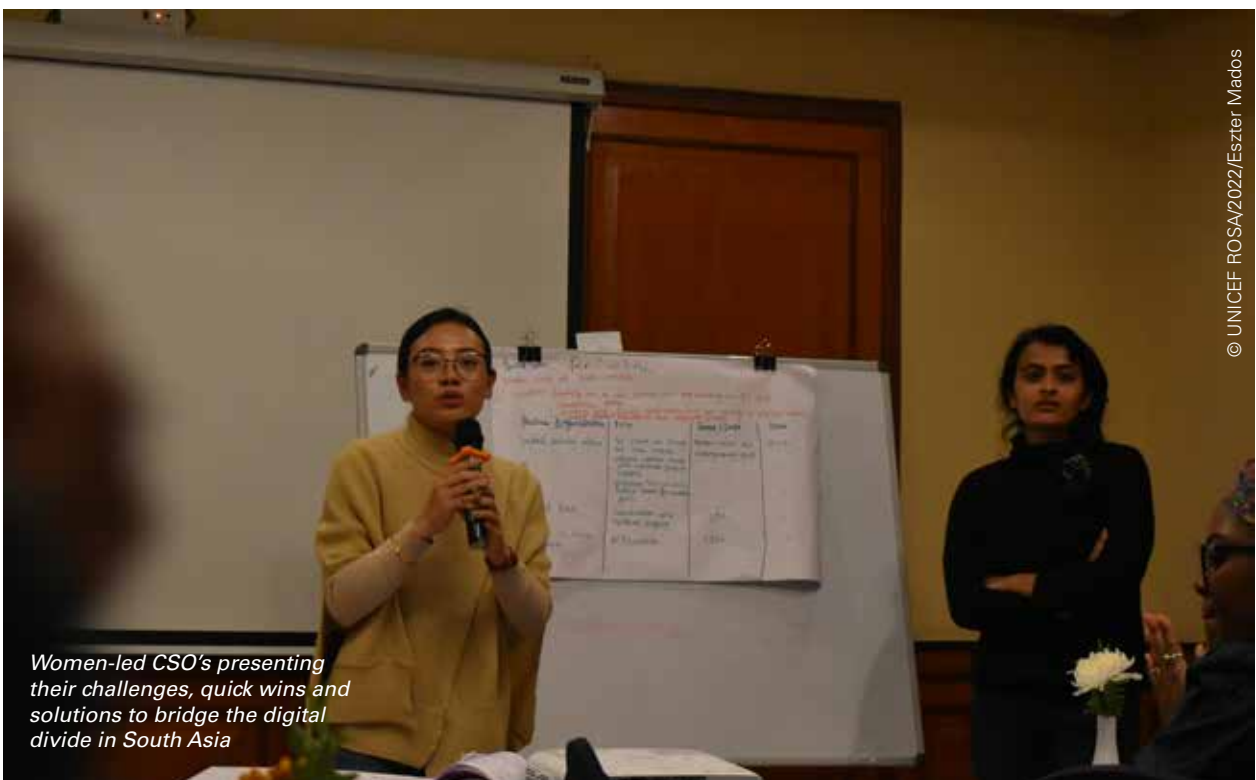
Women-led CSO's presenting their challenges, quick wins and solutions to bridge the digital divide in South Asia