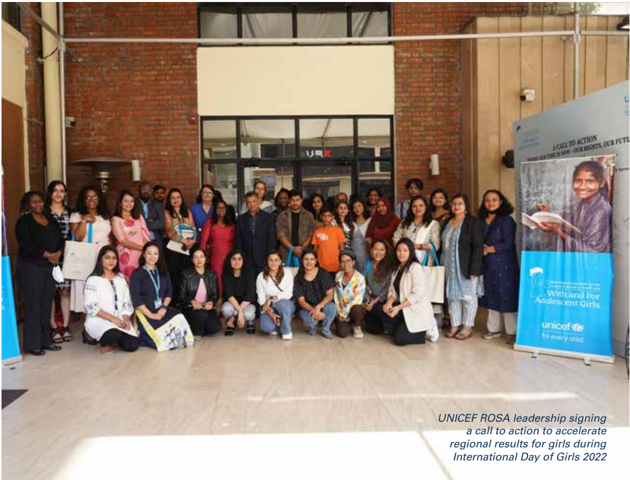
UNICEF ROSA leadership signing a call to action to accelerate regional results for girls during International Day of Girls 2022